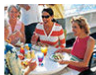
Guest with Disabilities Answers to your