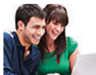
Documents Access your