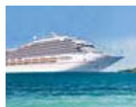
FAQs Answers to your