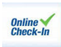
Online Check-In Save time at the pier!

Taxes, Fees & Port Expenses, as used by us, may include any and all fees, charges, tolls and taxes imposed on us by governmental or quasi-governmental authorities, as well third party fees and charges arising from a vessel's presence in a harbor or port. Taxes, Fees & Port Expenses may include U.S. Customs fees, head taxes, Panama Canal tolls, dockage fees, wharfage fees, inspection fees, pilotage, air taxes, hotel or VAT taxes incurred as part of a land tour, immigration and naturalization fees, and Internal Revenue Service fees, as well as fees for navigation, berthing, stevedoring, baggage handling/storage and security services. Taxes, Fees, & Port Expenses may be assessed per passenger, per berth, per ton or per vessel. Assessments calculated on a per ton or per vessel basis will be spread over the number of passengers on the Ship. Subject to applicable laws, Taxes, Fees & Port Expenses are subject to change and Carnival reserves the right to collect any increases in effect at the time of sailing even if the fare has already been paid in full.