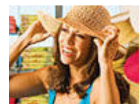
Gifts & Services Beautiful gifts