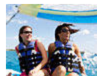
Book your shore excursions online