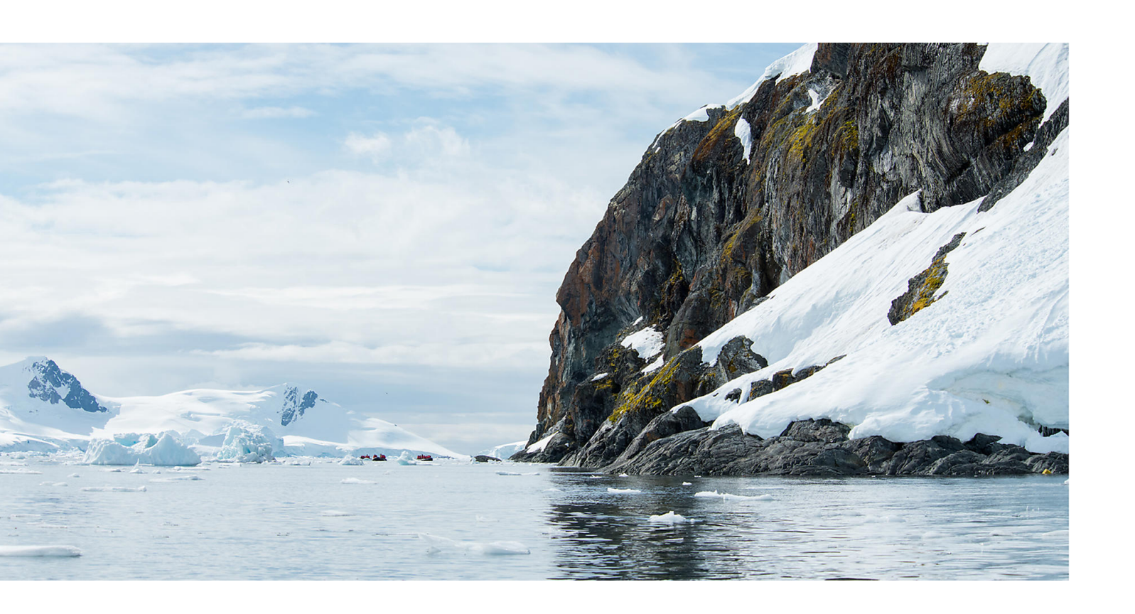
The information in this document is valid as of 12/8/2020