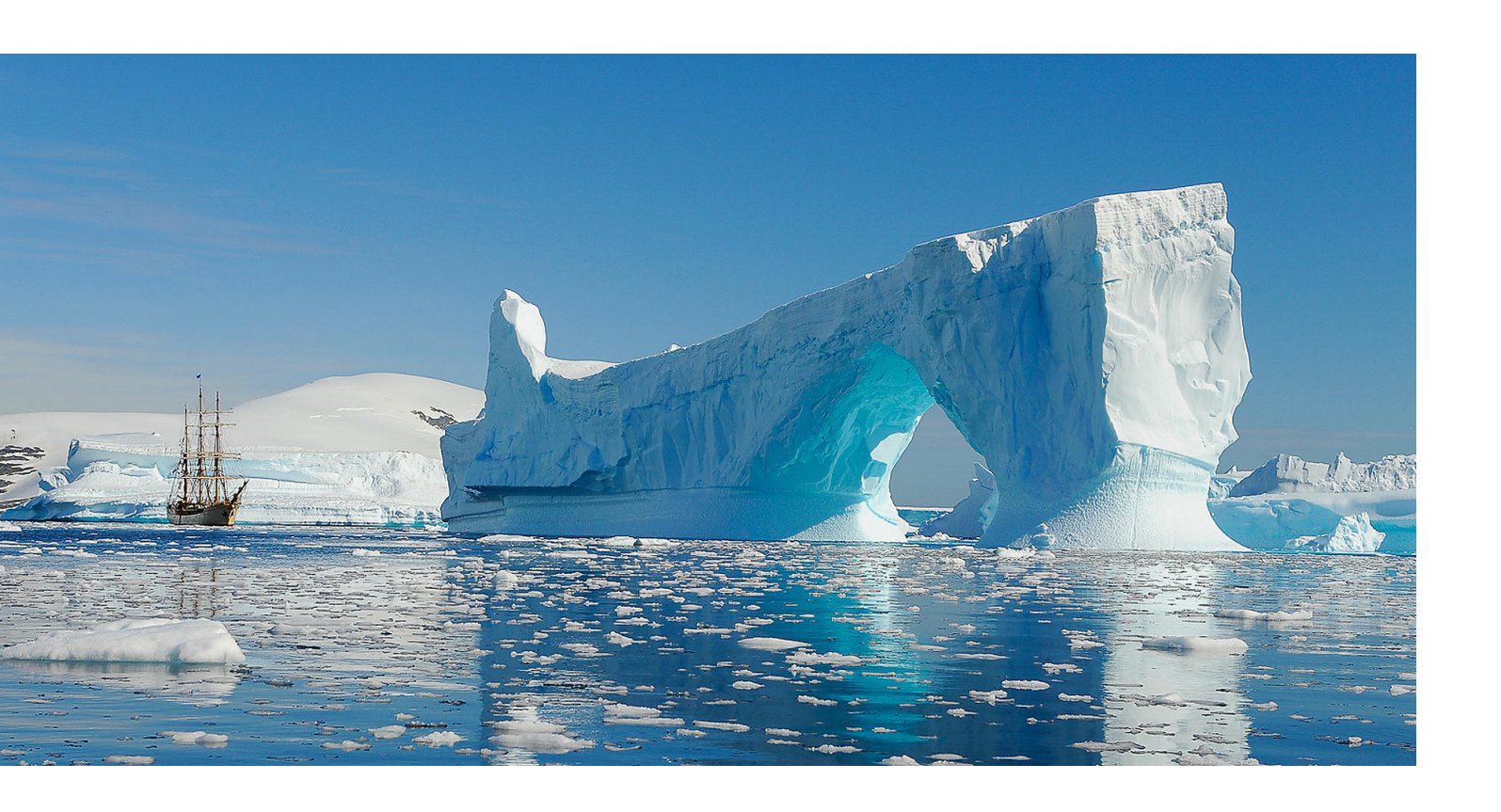
The information in this document is valid as of 12/8/2020