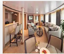
OWNER'S SUITE AND ABOVE FROM $36,999