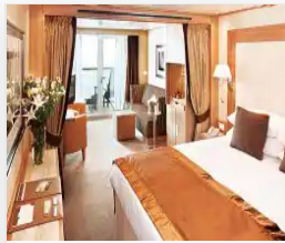
VERANDA SUITE FROM $15,999