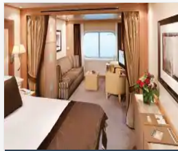
OCEAN VIEW FROM $15,999

Please select your suite type and category from the available options.