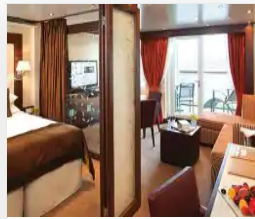
PENTHOUSE SUITE FROM $29,999